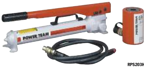
10,000 psi ASMEB30-1