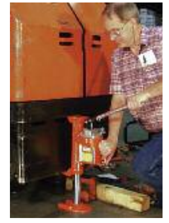
The J Series Toe Jack is an extremely rugged jack used here for lift truck service.