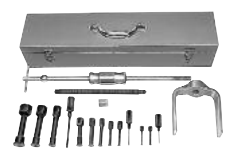
Set No. 981

Blind hole puller set – Removal of bearings, bushings, sleeves and other friction-fitted parts from blind holes can now be accomplished with ease. Set provides selection of expanding collets \frac{5}{16} " to \frac{1^3}{4} " I.D. Collet is placed through bore of part to be removed, then expanded with actuator