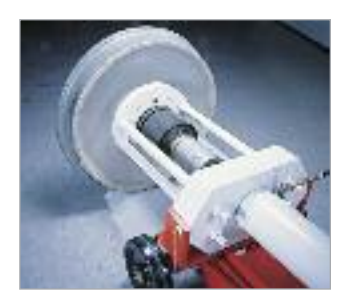
The photo above shows the Universal Puller in position on the roller bearing assembly, which is ready for removal.